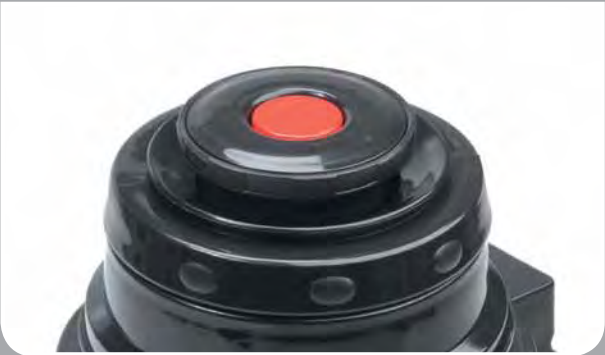
Press down spout release

The Primus Deluxe Flask is ideal for camping, picnics, worksites and other outdoor activities.